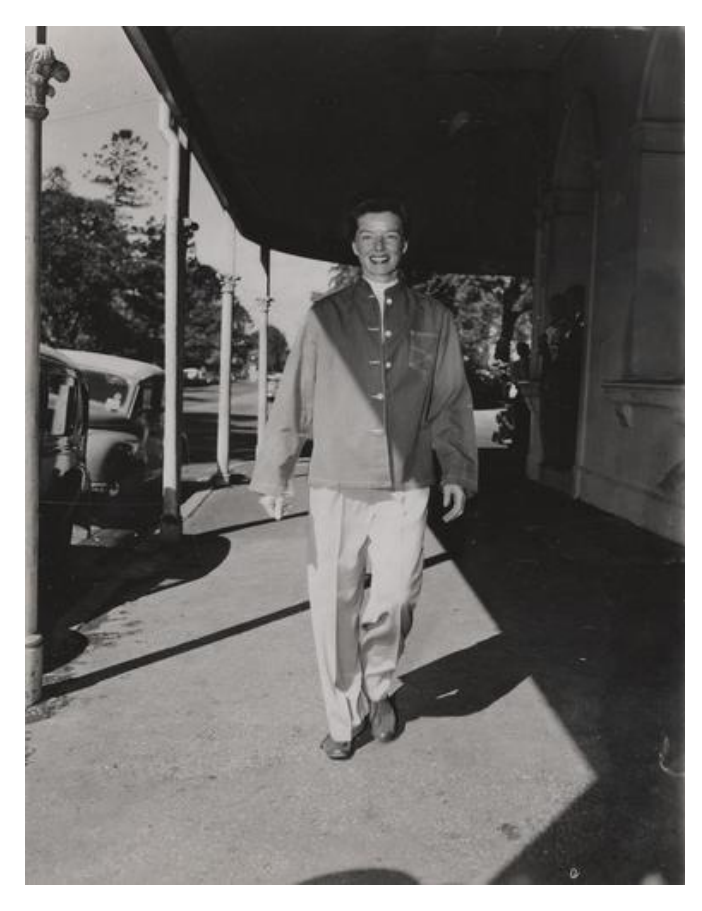
Figure 4: Hepburn strolling outside the Bellevue, on George Street

watercolours – producing "Breakfast in Bed" – a self-portrait at the Bellevue. This was recently auctioned for $47,000 (AUS).