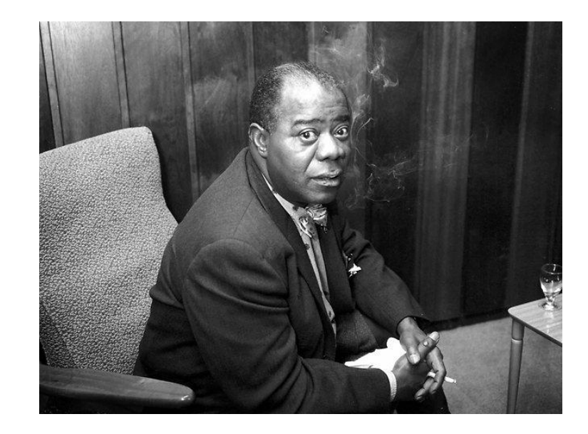
Figure 7: Armstrong at Brisbane Airport, 1963

Louis Armstrong came to Brisbane a number of times on his Australian tours including 1955, 1956 and 1963. He generally stayed at the Bellevue Hotel.